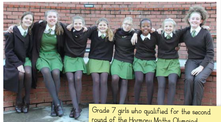
Grade 7 girls who qualified for the second round of the Harmony Maths Olympiad