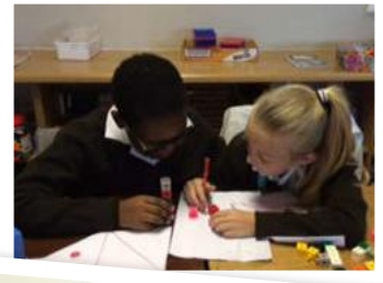
Girls participating in the IQQA Survey