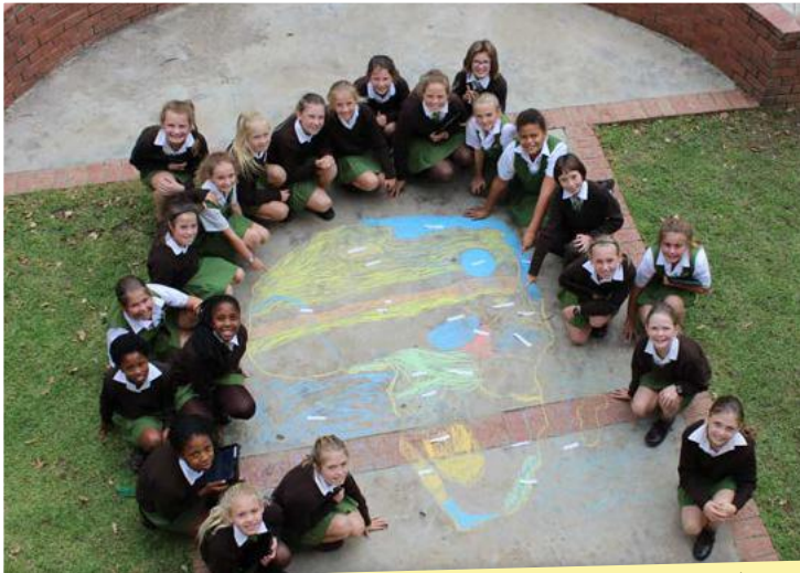
The Grade 5s used chalk to sketch the physical features of Africa onto the floor of our outdoor amphitheatre. They used their iPads to research the correct location of each feature on the African continent.