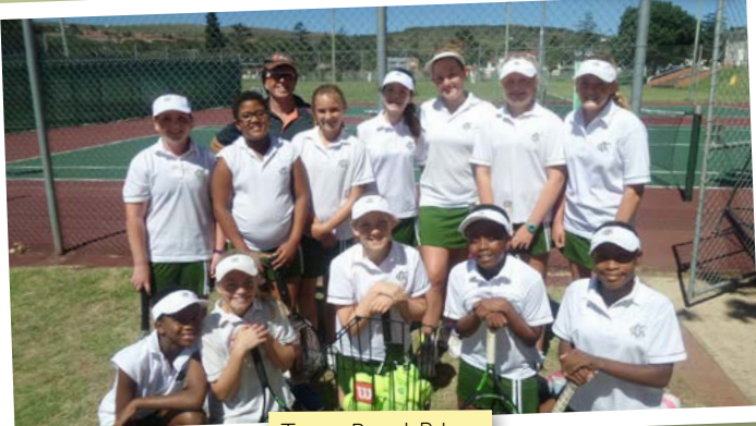
Tennis Round Robin