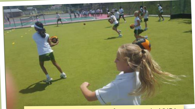
Girls playing dodgeball for the first time on the MUGA