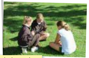
Exploring plant ecosystems