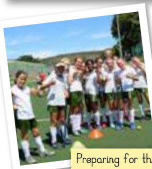
Preparing for the hockey and netball season

3 AUGUST – DSG Junior Hockey Festival (H)