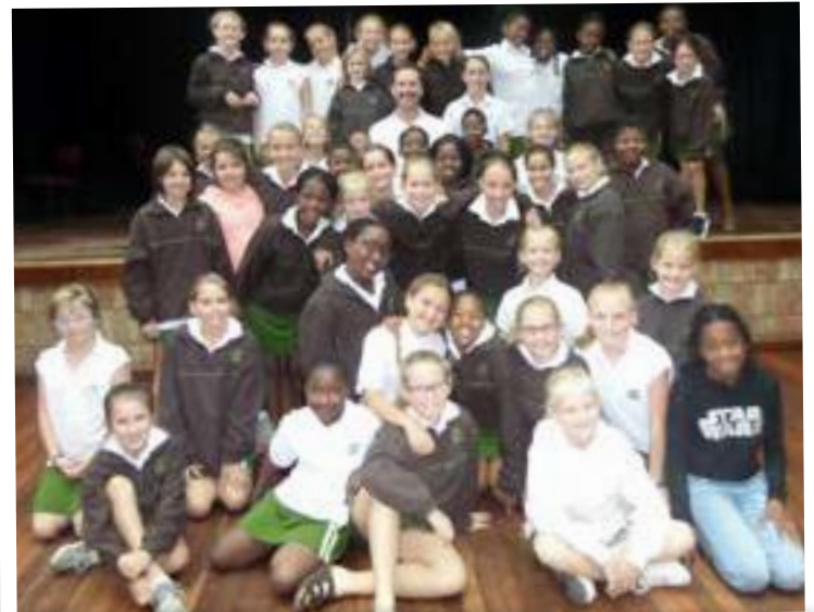
Grade 4 to 7 girls enjoyed two modules of My Social Life Digital Education